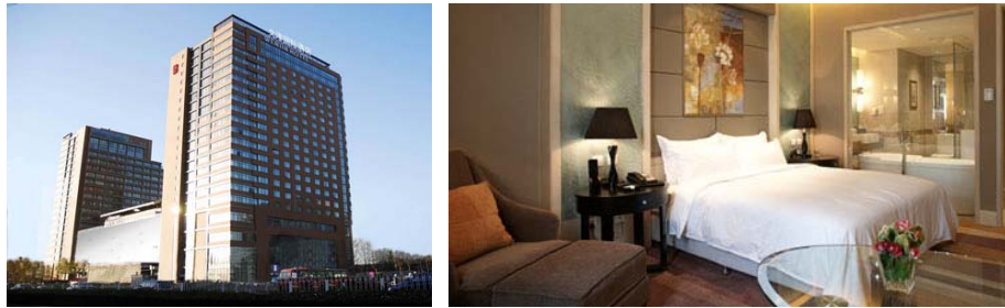
Overview of Wenjin Hotel

Address: Chengfu Road, Haidian, Beijing (北京海淀成府路清华大学南门西侧)